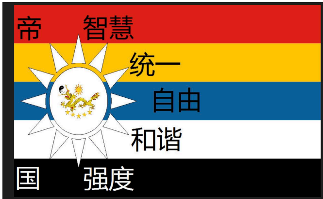
Flag of Chinese Empire (Chang Dynasty 1564-1949)

People's Republic of China = PRC Chinese Communist Party = CCP People's Liberation Army = PLA Military-Civil Fusion = MCF